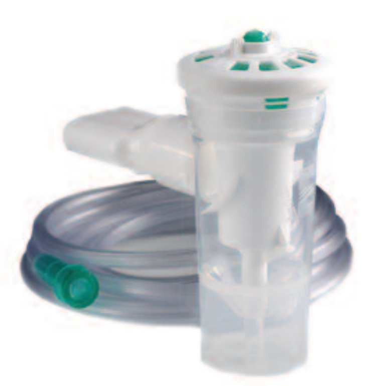
AeroEclipse® || BAN.

The AeroEclipse ® II BAN is designed to meet your patient needs throughout the hospital. You can use our AeroEclipse ® II BAN—with a mouthpiece or our latexfree masks—from the Emergency Department to the floors, from young to adult patients. Ask your Monaghan sales representative for example protocols.